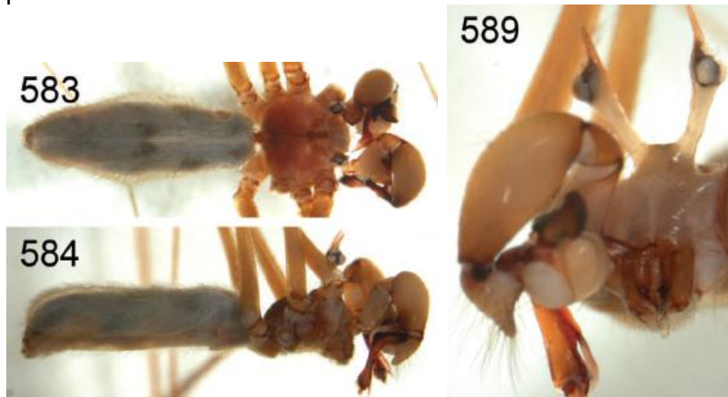
583, 584, 589. Ph. hurau , male, dorsal

and lateral views; male prosoma, frontal view.