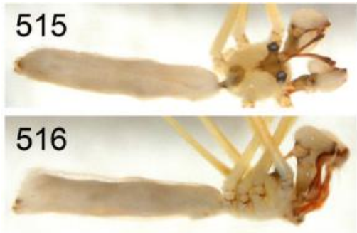
515, 516. Ph. satun , male,