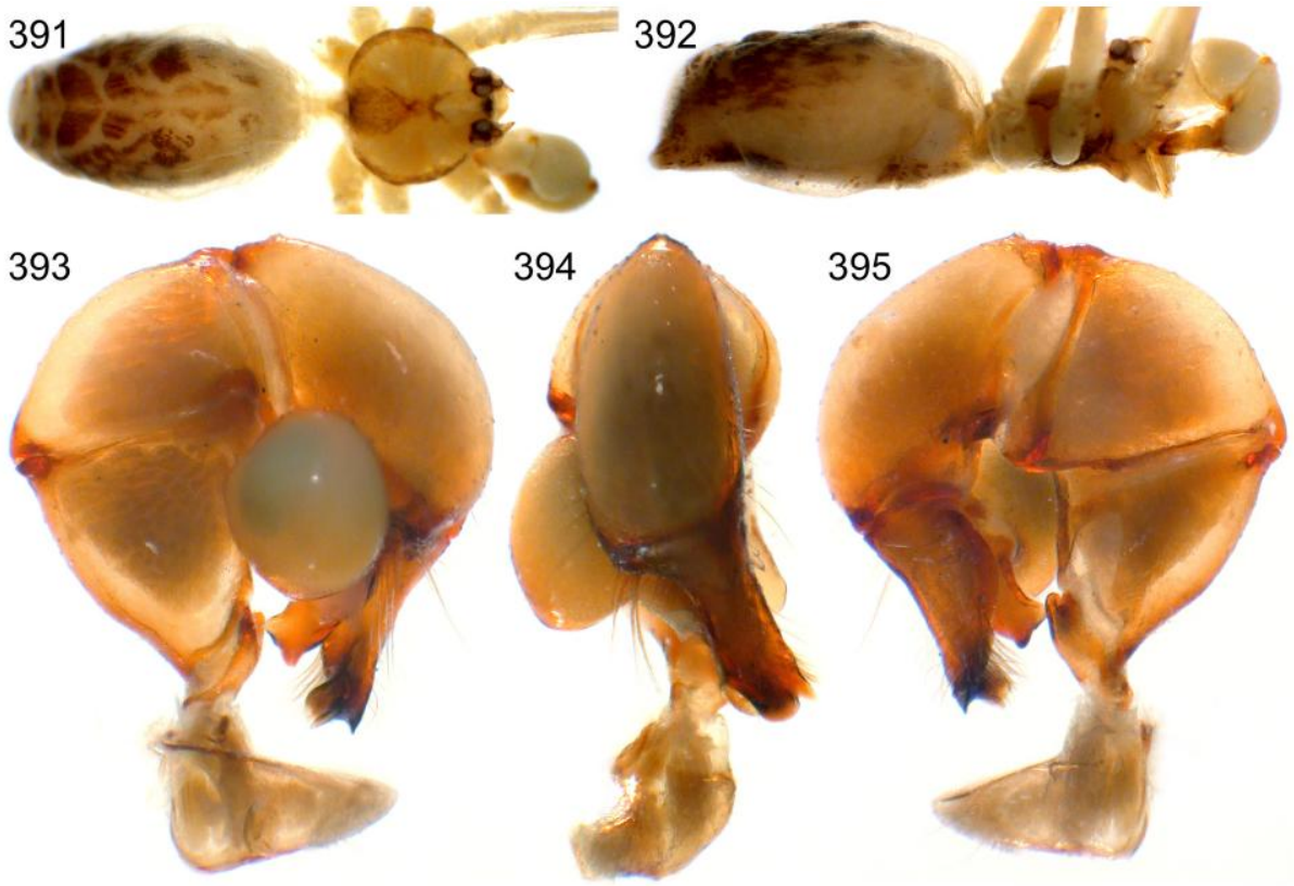
FIGURES 391–400. Smeringopina armata (Thorell) (391–395) 391–392, 396–397. Males, dorsal, lateral, and ventral views. 393–395, 398–400. Left male palps, prolateral, dorsal, and retrolateral views.